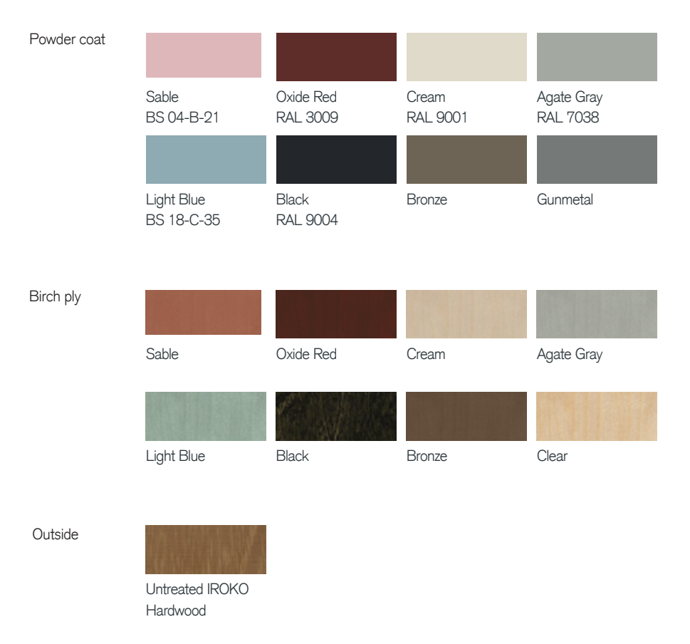
Table Top & Bench Seat Finishes