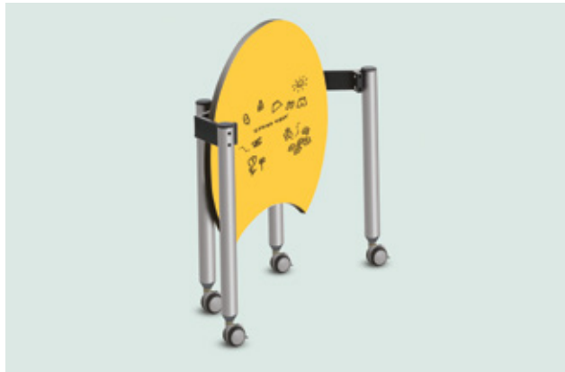
Dry-erase laminate writable tables

Write on your table surface horizontally and vertically.